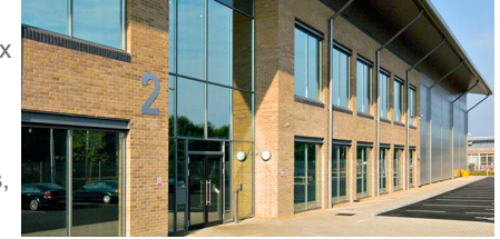
Equinix LD4 IBX exterior